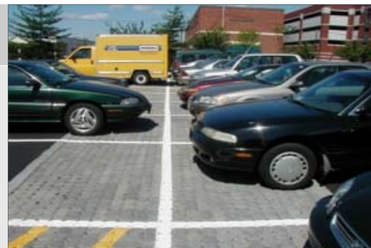
Porous pavement covers about 1/3 of each parking space in the D.C. Navy Yard parking

Retrofit a Parking Lot to increase permeability. Over sixty-five percent of impervious areas are associated with "habitat for cars". Using porous pavement in parking lots is a simple way to increase infiltration and reduce runoff. When the US Navy Yard in Washington, D.C. needed to repave its parking lot, they used porous pavers. They also added bioretention cells to the landscaped areas and disconnected downspouts. The re-design did not alter the amount of parking spots, but reduced peak runoff and pollution, thus protecting and helping to restore the Anacostia and Potomac Rivers and the Chesapeake Bay.